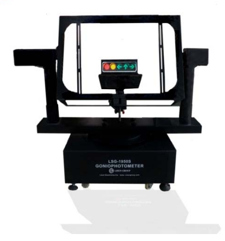
LSG-1950S Economic Version